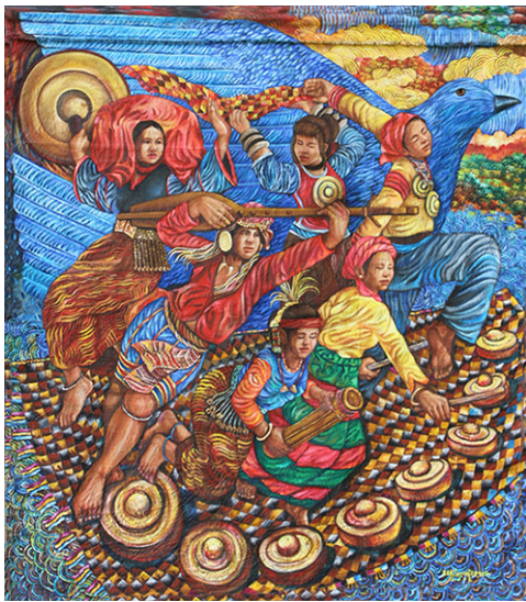
graphic: Bert Monterra